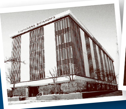
The Sam Bernstein Law Firm's first offices were located in the Congress Building.